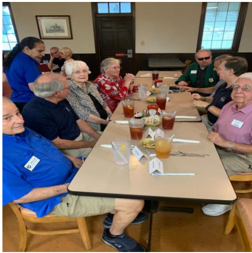
A FUN TIME WAS HAD BY ALL