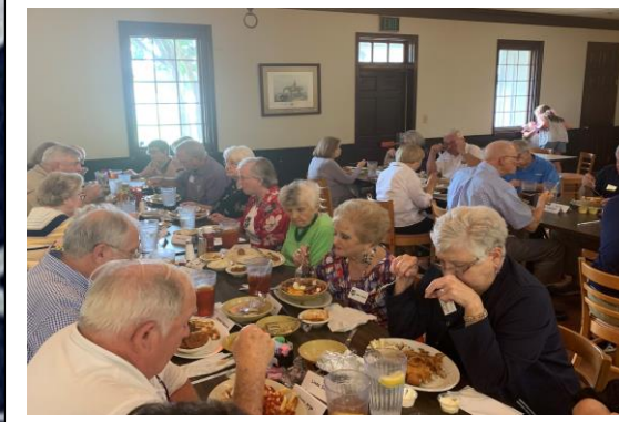
At Lloyd's Restaurant – good time!